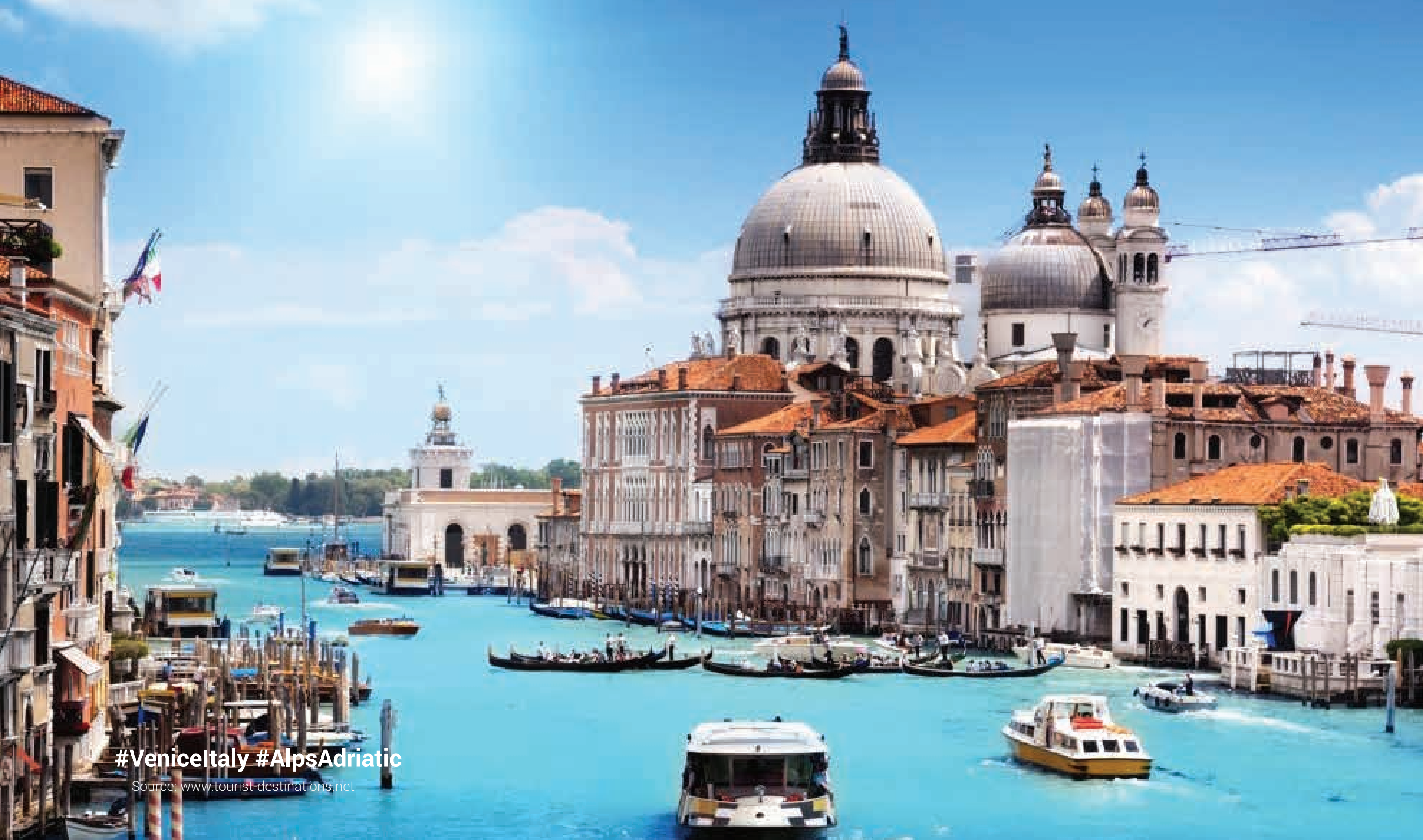
#VeniceItaly #AlpsAdriatic