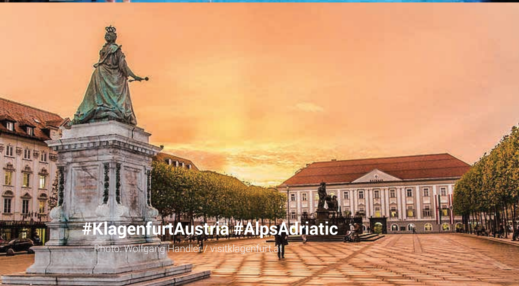
#KlagenfurtAustria #AlpsAdriatic