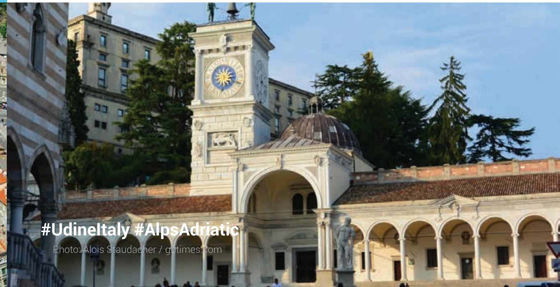
#UdineItaly #AlpsAdriatic