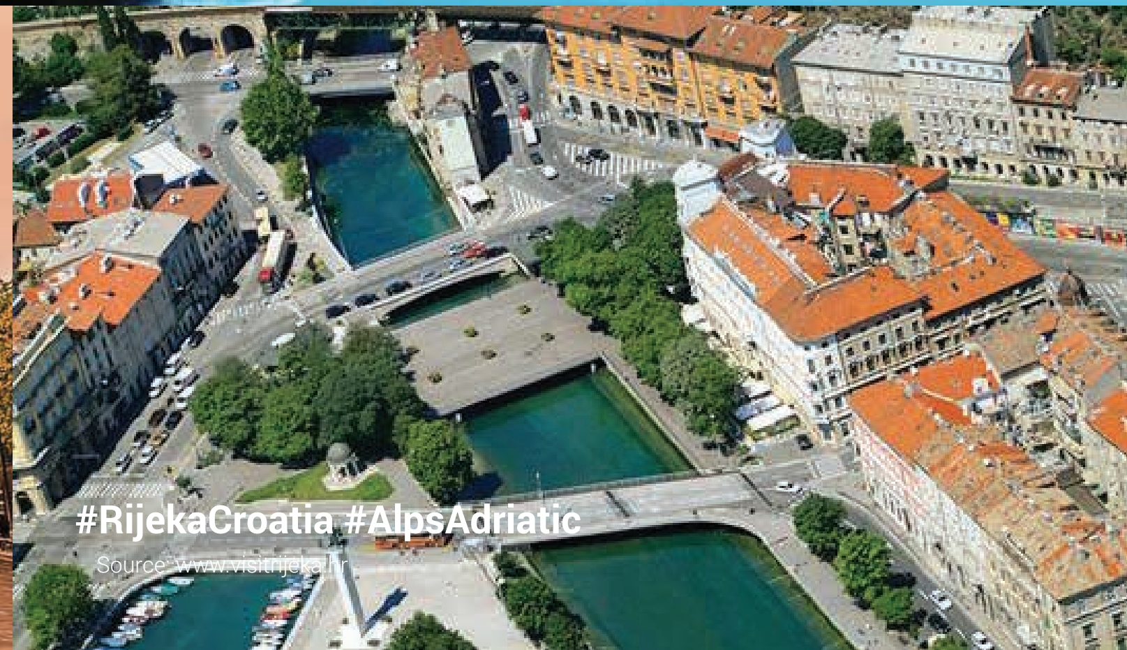
#RijekaCroatia #AlpsAdriatic